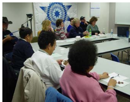
Juneberry Workshop in November