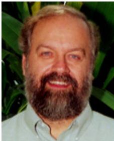
NRE on the Web